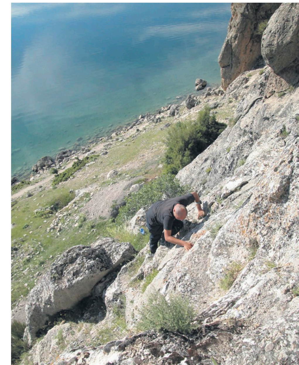
Rock-cut stairs lead up to tiny chapels cut in the cliffs overlooking Lake Egirdir.

The trail A Wild Walk in the Taurus Mountains costs $1,608 (Dh5,905) for nine days. The price includes guided walking, all accommodation, meals, soft drinks and entrance fees but not flights. To make a reservation, visit www.wildfrontiers.co.uk (0044 20 7736 3968). Mike Belton also runs Amber Travel ( www.ambertravel.com ), based in Kas on the Turkish coast. He can arrange guided and self-guided walking tours all over the country including the St Paul Trail and the coastal Lycian Way. For information about walking in this area of Turkey and to buy a map of the trail, visit www.lycianway.com