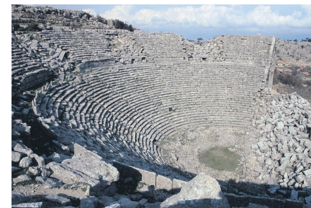
The Roman theatre from the second century AD at Selge boasts a nearly complete seating area.