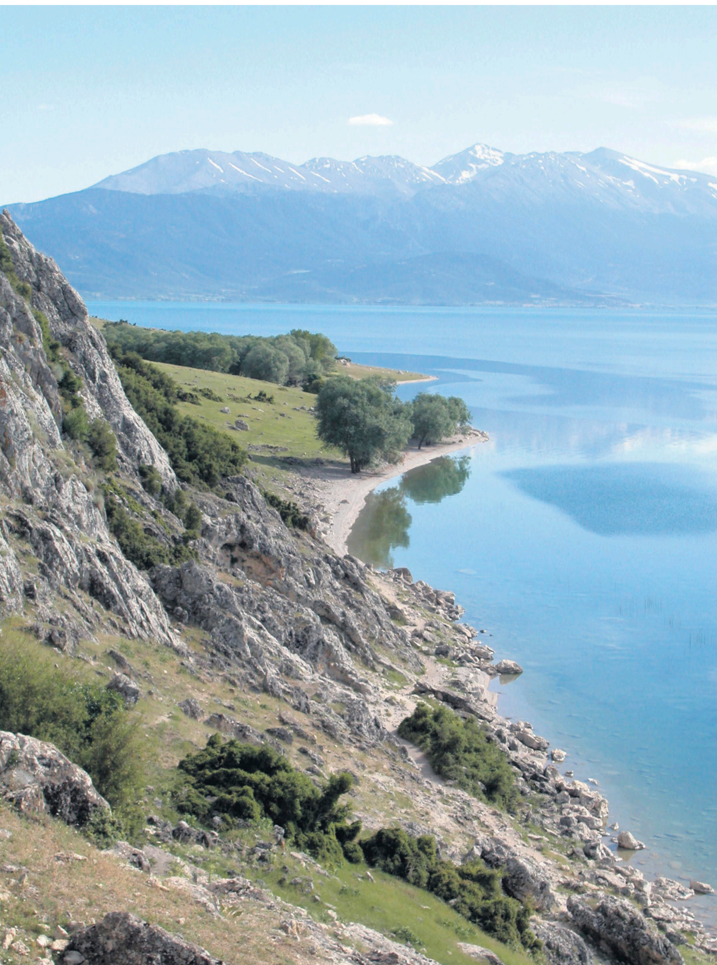
Above, the St Paul Trail skirts around Lake Egirdir, which today is popular with local and foreign tourists. Above, right, travellers on the trail must ford waterways such as the Degirmendere River.