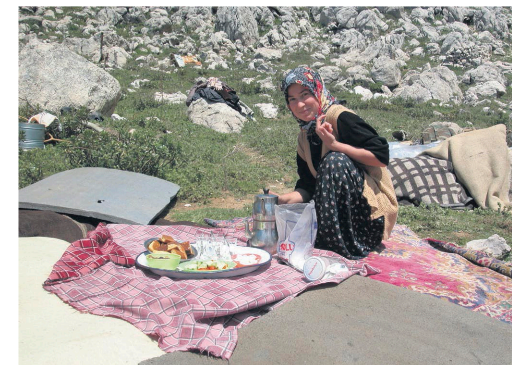
Some trail guides can arrange for local shepherds to prepare traditional meals for travellers.